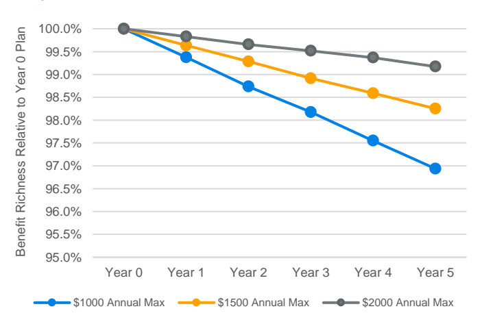
FIGURE 3: BENEFIT RICHNESS BY YEAR WITH FLAT ANNUAL BENEFIT MAXIMUM

Figure 3 shows the change in benefit richness of three sample plans over the course of five years relative to the starting benefit richness in Year 0. Each plan is modeled as having no deductible and coinsurance levels of 100%, 80%, and 50% for Class I, Class II, and Class III procedures, respectively. The plans vary by benefit maximum, which remains flat over the five-year period. Claims are trended annually with 3% unit cost trend and 1% utilization trend. The results demonstrate that, because of trend, the same benefit maximum over time will produce a leaner plan design, all else equal. As illustrated by the steepest slope for the plan with a $1,000 annual benefit maximum, plans with lesser benefit maximums have faster rates of benefit richness reduction, because the lower the benefit maximum the more claims are affected by the benefit limitation. Carriers whose rating manuals