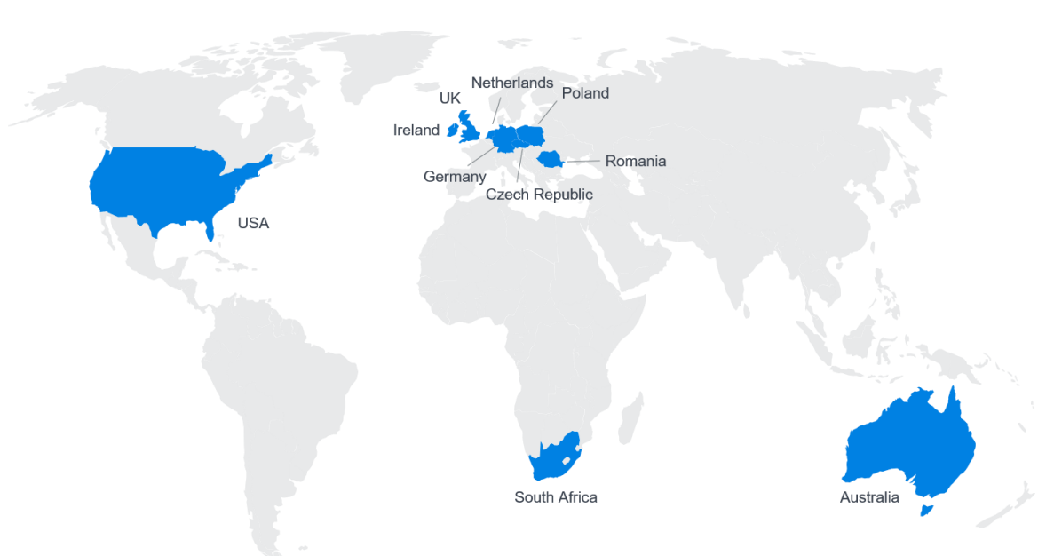
FIGURE 1: COUNTRIES CONSIDERED IN THIS PAPER

The countries considered in the illustrative examples outlined in this paper are highlighted in Figure 1. This includes a mix of countries that currently have functioning risk equalisation schemes as part of their healthcare systems as well as countries where healthcare reform or the implementation of risk equalisation was not successful. It is important to consider both successes and failures in understanding the challenges faced in implementing and managing a risk equalisation system.